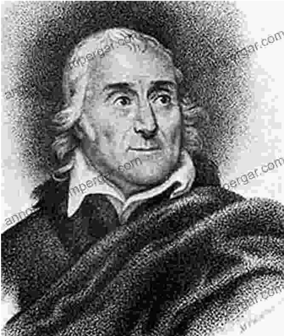
The Librettist of Venice: The Remarkable Life of Lorenzo Da Ponte--Mozart's Poet, Casanova's Friend,