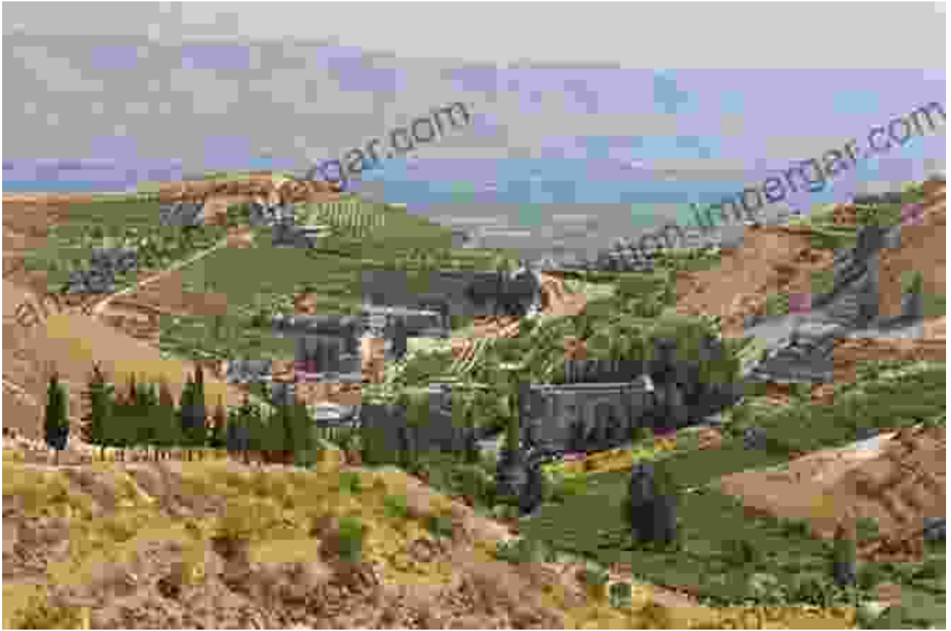
The Bekaa Valley