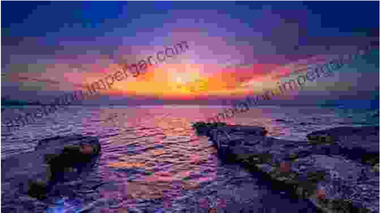
A sunset over the Mediterranean Sea