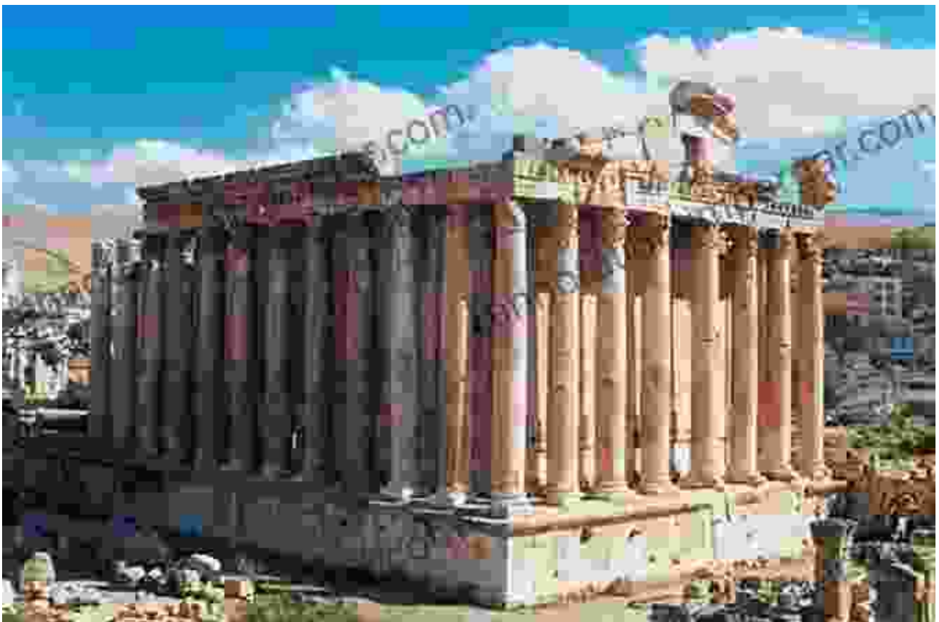
The Baalbek temples

Here are a few images that capture the beauty and spirit of Lebanon: