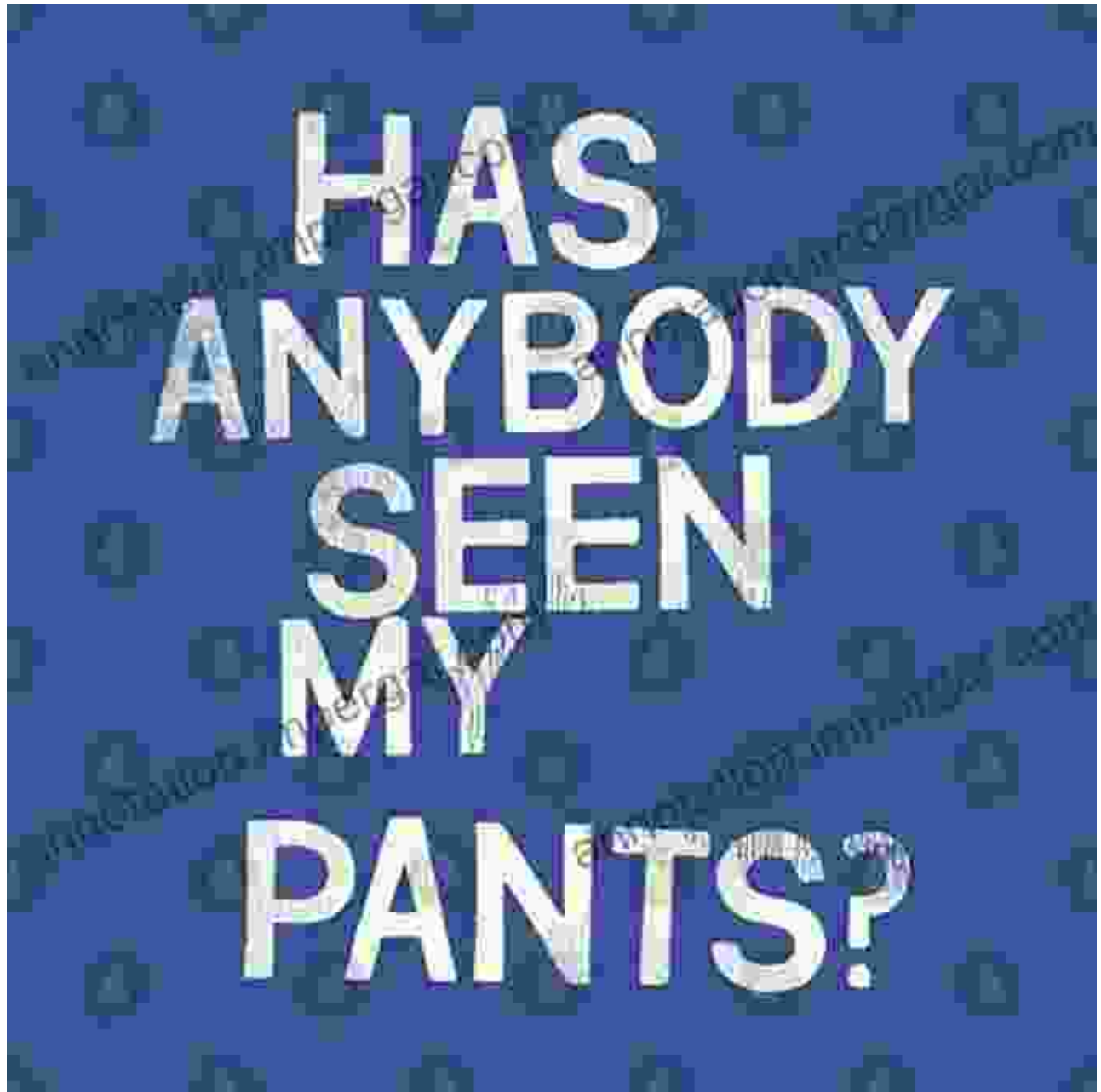
Has Anyone Seen My Pants? by Sarah Colonna