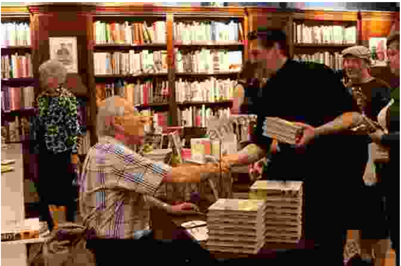
experiencing the rewards of connecting with readers

In a refreshingly honest account, the author shares their own experiences with these hurdles, revealing how they navigated self-doubt, dealt with negative feedback, and found the resilience to keep writing despite the setbacks. Their story is a testament to the perseverance and determination required to succeed in the literary world.